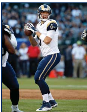
QB Nick Foles