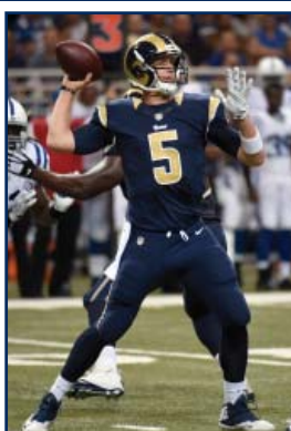
QB Nick Foles

The St. Louis Rams kickoff the 2015 season Sunday as they host the two-time defending NFC Champion Seattle Seahawks at the Edward Jones Dome.