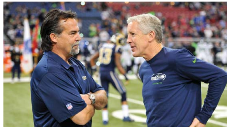
Head Coaches Jeff Fisher and Pete Carroll chat prior to the Rams' 28-26 win over the Seahawks last October at the Edward Jones Dome.