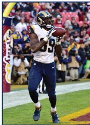
TE Jared Cook

Perhaps Cook's best performance of the season came in a Week 14 win over Washington. Early in the game, Cook absorbed a big hit, and it appeared St. Louis might have to play the majority of the game without him. Fortunately, he bounced back to catch two touchdown passes in the 24-0 win over the Redskins.