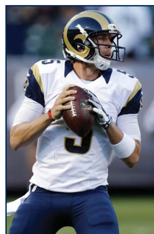
QB Nick Foles