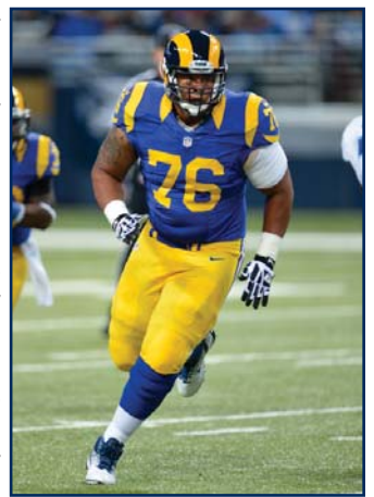
G Rodger Saffold

When the Rams drafted Saffold in the second round in 2010, he immediately became the team's left tackle and started his first 35 games there. In 2013, he began the season at right tackle before moving inside. He's now entrenched at the guard position, no matter what side it is. Of his 60 career starts, 36 have come at left tackle, 13 at left guard, four at right tackle and seven at right guard.