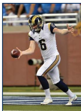
P Johnny Hekker

In 48 career games that Hekker, has recorded a net average of 45.0 yards or more on 13 different occasions, including the last two weeks of the 2014 season when he netted 45.5 against the Giants and 48.0 against the Seahawks. Hekker finished 4th in the NFL in 2014 in net average (42.3) and 8th in gross (46.5).