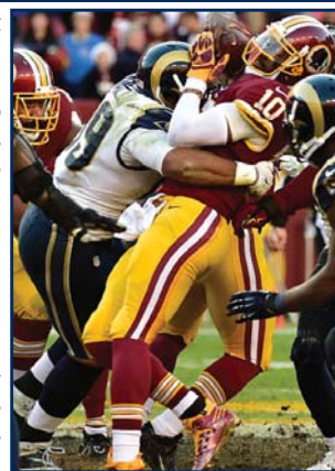
DT Aaron Donald

Donald also posted a team-high 17 tackles for loss on the season and coaches have credited him with 32 QB pressures and 12 QB hits. His 9.0 sacks were second most amongst all NFL defensive tackles.