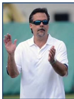
Head Coach Jeff Fisher

With the team's Week 14 win over Washington, Fisher passed Mike Holmgren for 13th on the NFL's all-time wins list. Next up on the list is Fisher's good friend Mike Shanahan, who has 170 career wins.