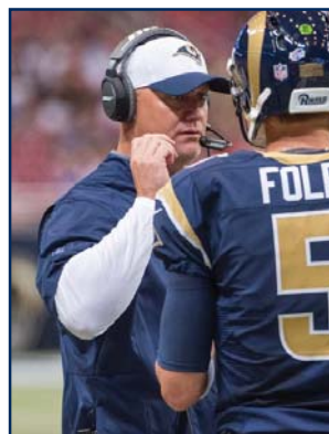
QB Coach Chris Weinke