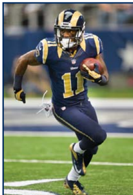
WR Tavon Austin

In the team's Week 14 win at Washington, Austin returned a punt 78 yards for a touchdown. He had 143 total punt return yards, most by an NFL player in a game this season. In addition to his touchdown return, Austin also had returns of 37 and 28 yards. He was named NFC Special Teams Player of the Week for his efforts, his second such award of his career.