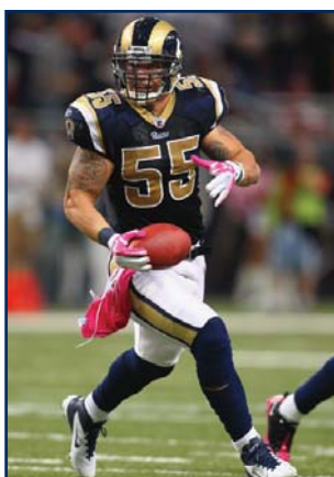
LB James Laurinaitis

Laurinaitis now has 901 career tackles, and he's closing in on Hall of Famer Merlin Olsen, the franchise's all-time leading tackler.